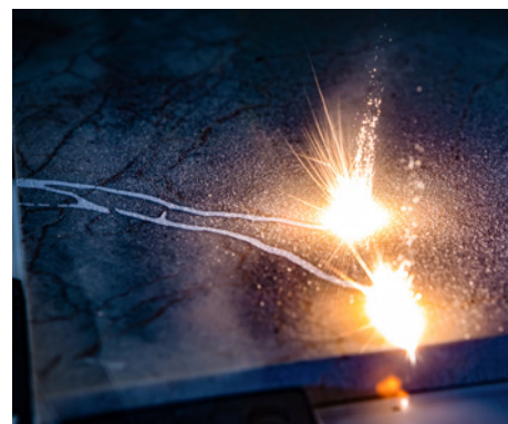
A laser burns away flaws in the marble

and pressurised air clean the slab and prepare it for the fifth step – refinishing. Once they have been primed, the lasered sections of the surface are refilled with UV-resistant material by a printer that was created by an Austrian company